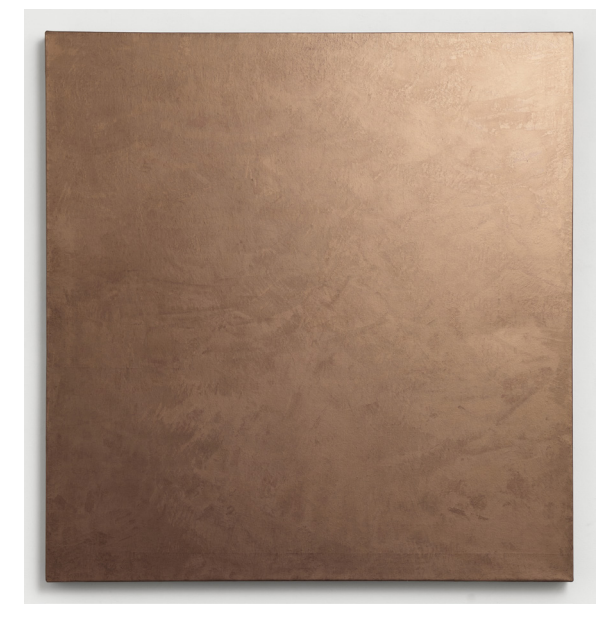
David Simpson, Royal Couple (2 of 2), 1997 Acrylic on canvas, 48 x 48 inches