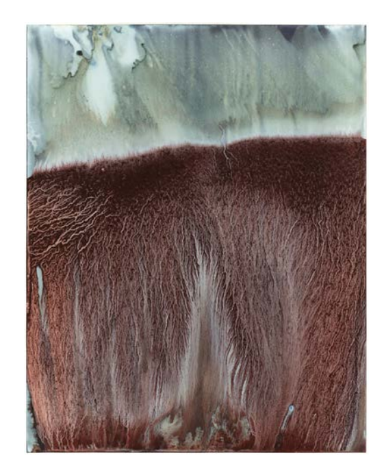
Meghann Riepenhoff, Day 287: mushroom ink + Prussian Blue pigment + algae pigment + beta carotene + ginkgo chlorophyll + Rattlesnake Lake + Moncton old growth stump, 2024 Unique Dynamic Cyanotype, 24 x 19 inches

Irene Fung irene@hainesgallery.com / 415.397.8114