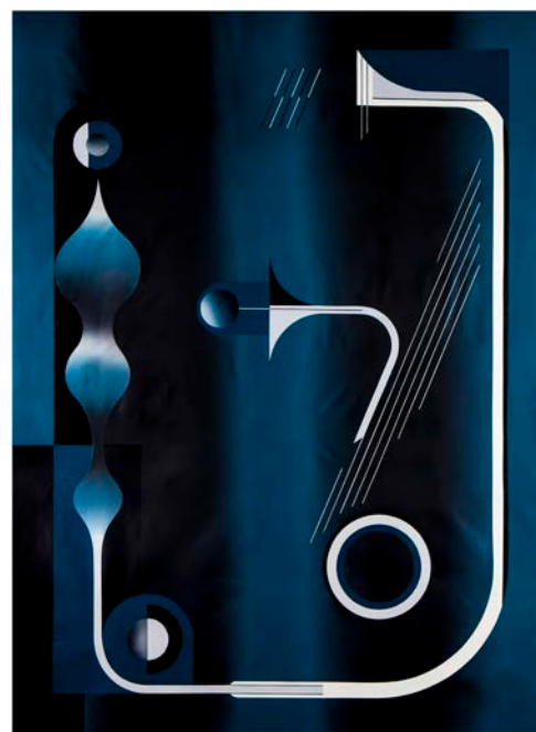
Julian Prebisch, Untitled , 2018 acrylic on canvas, 75 x 46 inches

Los Angeles-based painter Yunhee Min (b. 1964, Seoul, South Korea) foregrounds the sensations of color and light, while drawing to attention to the materiality of paint, its movement and viscosity. Min works with a variety of tools, including brushes, rollers, and squeegees, applying brightly colored swathes of paint that appear to swell and surge across her canvases. In some areas, sheer washes of color may overlap to create new shades; in others, they may thicken and pool together into marbled ripples. Min's paintings appears almost luminescent, and the gestural fluidity of each wide stroke belies the rigorous preparation behind the works, with the artist often spending several days in her studio mixing paint to a specific shade and viscosity.