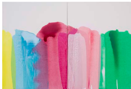
Yunhee Min, Movements (Serpentine 6) , 2015 acrylic on canvas, 41 x 60 inches