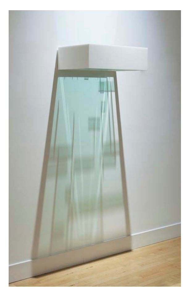
Won Ju Lim, Kiss 11 , 2015 Plexiglas, light 7.25 x 24 x 17 inches

Irene Fung <a href="mailto:irene@hainesgallery.com">irene@hainesgallery.com</a> / 415.397.8114