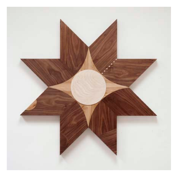
Lena Wolff, Full Moon Star, 2021 Walnut, beech, maple 42 x 42 x 2 inches

Won Ju Lim (b. 1968, lives and works in Los Angeles, CA) invites audiences to reconsider the built environment and its relation to memory, fantasy, and longing. With a sly nod to Donald Judd, her wall-hung sculpture Kiss 11 (2015) produces a cascade of colorful shadows when light passes through it. Within the piece are architectural models