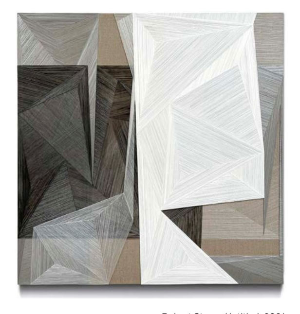
Robert Stone, Untitled , 2021 Acrylic and mixed media on linen-wrapped panel 36 x 36 inches